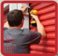
Individual Unit Door Alarms