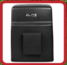
Automatic Commercial Gate Operators

Our commitment is to bring a full complement of products and services to you with full support in every essential area. Fully compatible and connected.