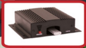
Music & Sound Systems