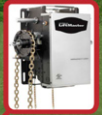
Automatic Commercial Door Operators